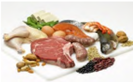
Meat, fish and beans

Include at least one portion of fruit and one portion of vegetables or salad every day to provide essential vitamins, minerals and fibre to boost the immune system and help fight disease.