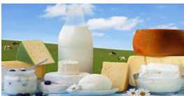
Milk, cheese and dairy

Starchy carbohydrates should be included every day to give slow release energy to see you through the afternoon. Malt loaf, bread sticks, cracker are an alternative to sandwiches.