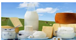
Milk, cheese and dairy

Starchy carbohydrates should be included every day to give slow release energy to see you through the afternoon. Malt loaf, bread sticks, cracker are an alternative to sandwiches.