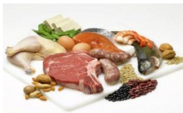
Meat, fish and beans

Include at least one portion of fruit and one portion of vegetables or salad every day to provide essential vitamins, minerals and fibre to boost the immune system and help fight disease.