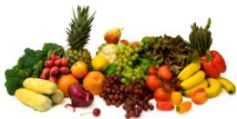
Fruits and vegetables

For a balanced meal, select from these food groups: