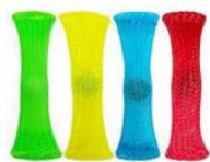
Marble in mesh