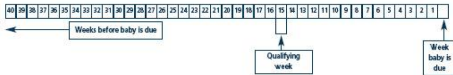
Diagram showing the qualifying week

The diagram below shows how to identify the "Qualifying Week".